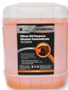
Cleaners- Citrus All Purpose Cleaner Concentrate