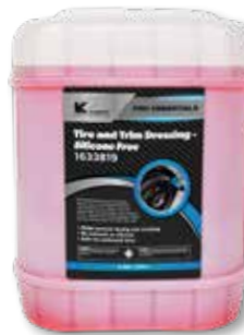
Dressings- Tire and Trim Dressing -Silicone Free