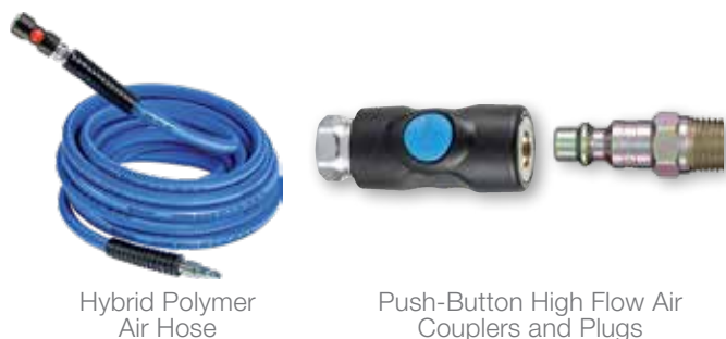
Hybrid Polymer Air Hose