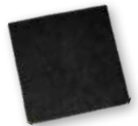
Accessories- Microfiber Towel 16" x 16"