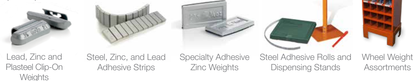
Lead, Zinc and Plasteel Clip-On Weights

Get access to a full range of quality wheel weights without the worry of hazardous lead disposal. Our wheel weights have received a proud seal of approval: they're used and trusted by OEM's. Manufactured with high-density zinc or steel and poly-coated for longevity, Kent Automotive's wheel weights are available in many sizes and configurations for precise balancing and steady shop throughput. Lead wheel weights are available upon request.