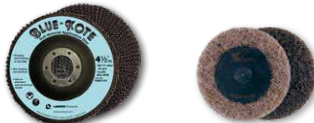
Blue-Kote® Abrasive Flap Discs