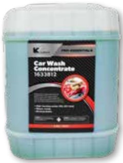
Soaps- Car Wash Concentrate